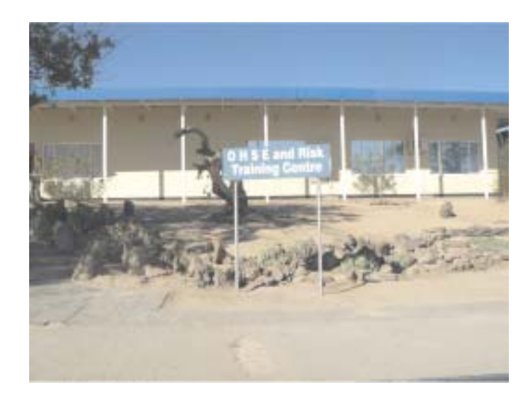
Rössing's OHSE and Risk Training Centre