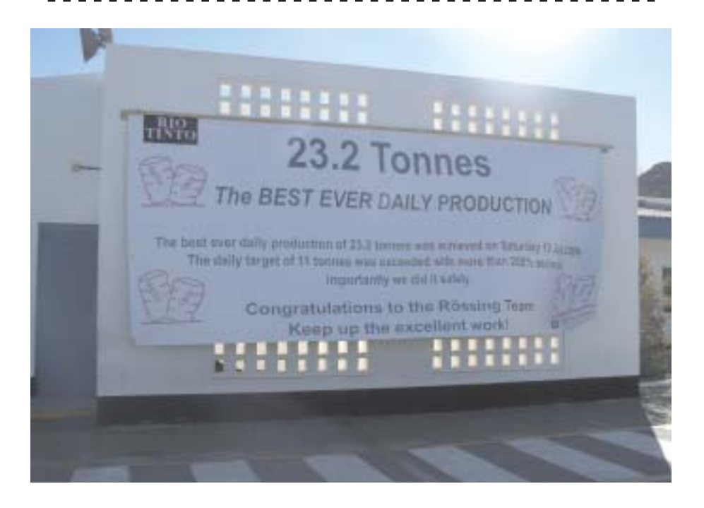
Highest daily production achieved at Rössing

The increased diversification of Namibia's mining sector away from diamonds is a very healthy development for the future of our country (New Era, 24 April, 2007).