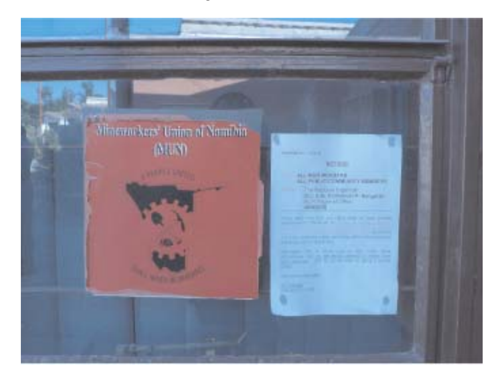
MUN office in Arandis

The Mine Workers Union of Namibia (MUN) is a recognized bargaining agent for mine workers in Namibia. The MUN is also the only sole bargaining agent on behalf of workers at Rössing.