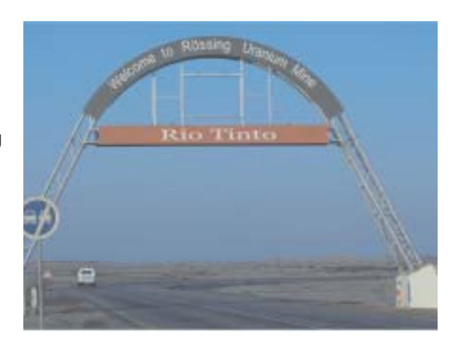
Entry to Rössing Uranium mine

The contribution of Rössing to the economy is enormous. In the year 2006 alone, Rössing contributed N$158 (close to US$ 20) million to government coffers through tax revenues. Production at this site makes up about 3% of the Gross Domestic Product of Namibia (GDP) and 10% of the country's foreign exports. The mine has committed itself in August 2007 to a N$784 million (US$112 million) lifespan extension project that will see the mine through to 2022. This extension is due to the demand for uranium worldwide.